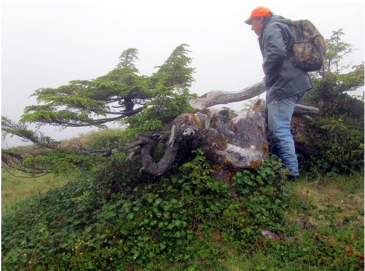
Clay beside an ancient tree sculpted by the harsh conditions.

I often find myself more fascinated by the habitats than the individual plants and this mossy habitat is exactly the type I have been trying to mimic in some of our troughs.