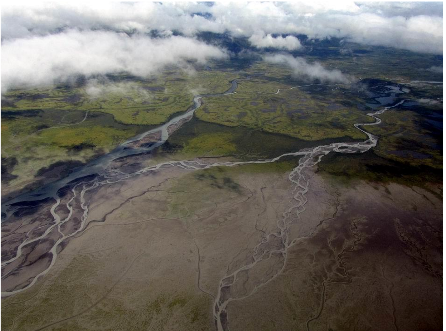
From Cordova I flew back up to Anchorage over some spectacular glacial scenery and I spent most of the short flight taking pictures out of the window.