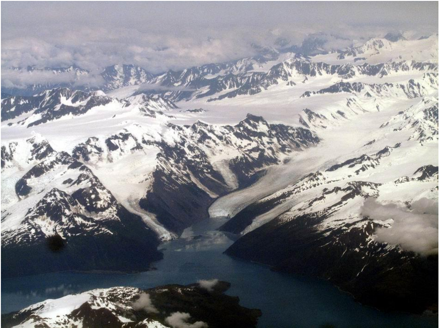
Glacier and mountains on Prince William Sound.