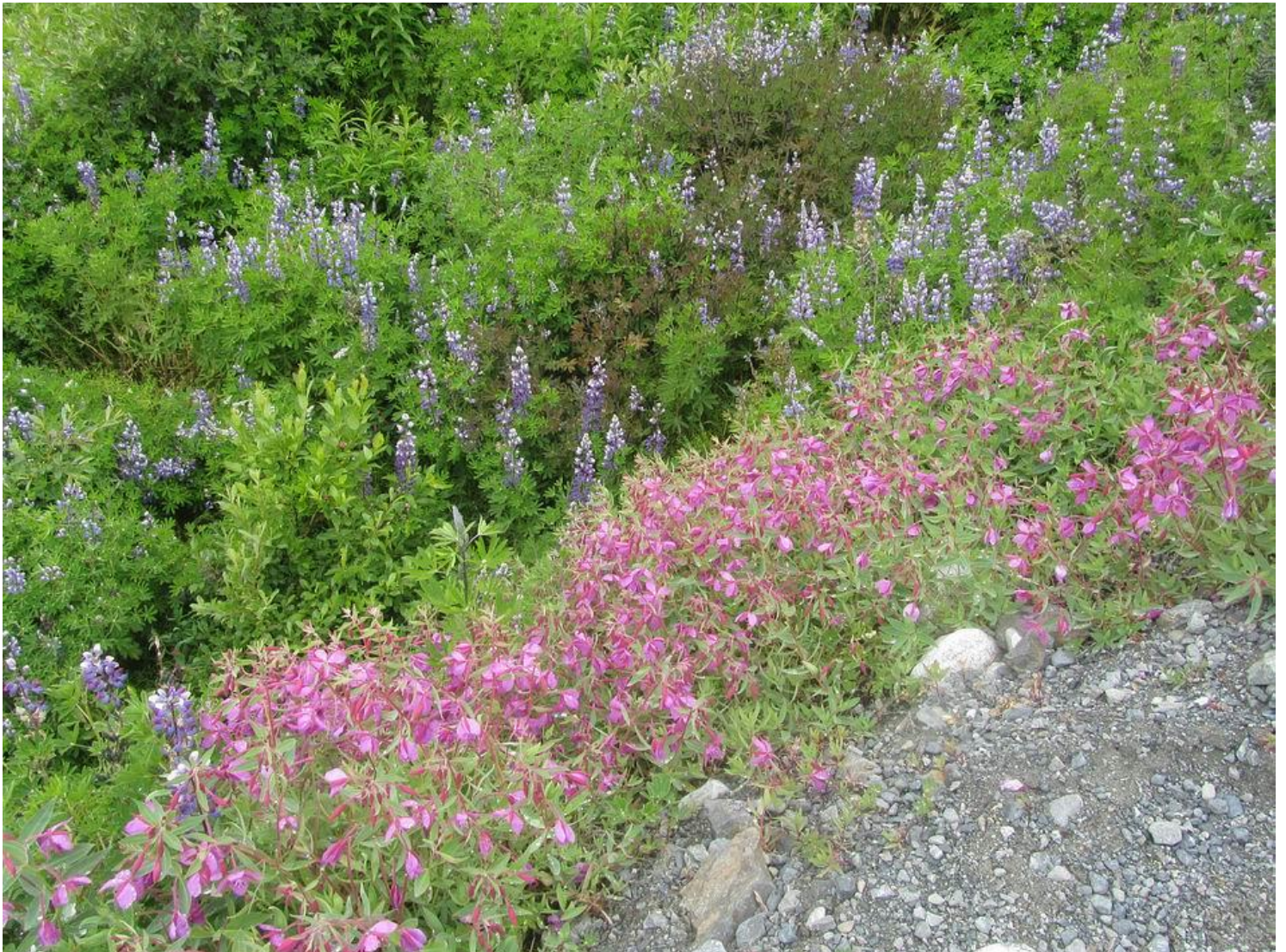
Chamerion latifolium and Lupins grew right alongside the glacier.

Everything about the glacier was fascinating and beautiful, especially the reflections where it merged into the water. Even the dirty peaks of ice covered in ground rock dust and sitting in the water clouded by mud were stunning.