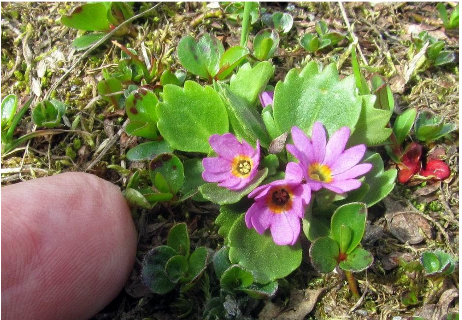
I was also delighted to find the tiny Primula cuneifolia flowering on Hatcher Pass.