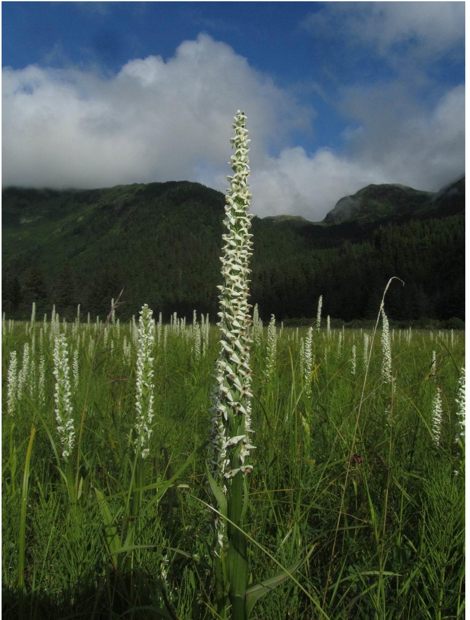
I also visited a water meadow where there were thousands of Spiranthes in bloom, many coming up to my waist.