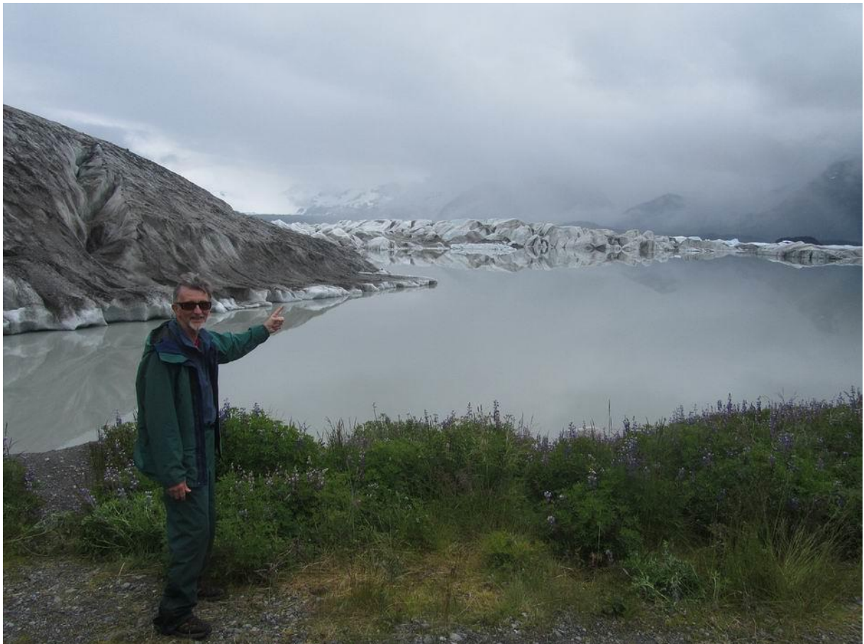
One of the many highlights and probably the most scenic sight was Sheridan glacier.