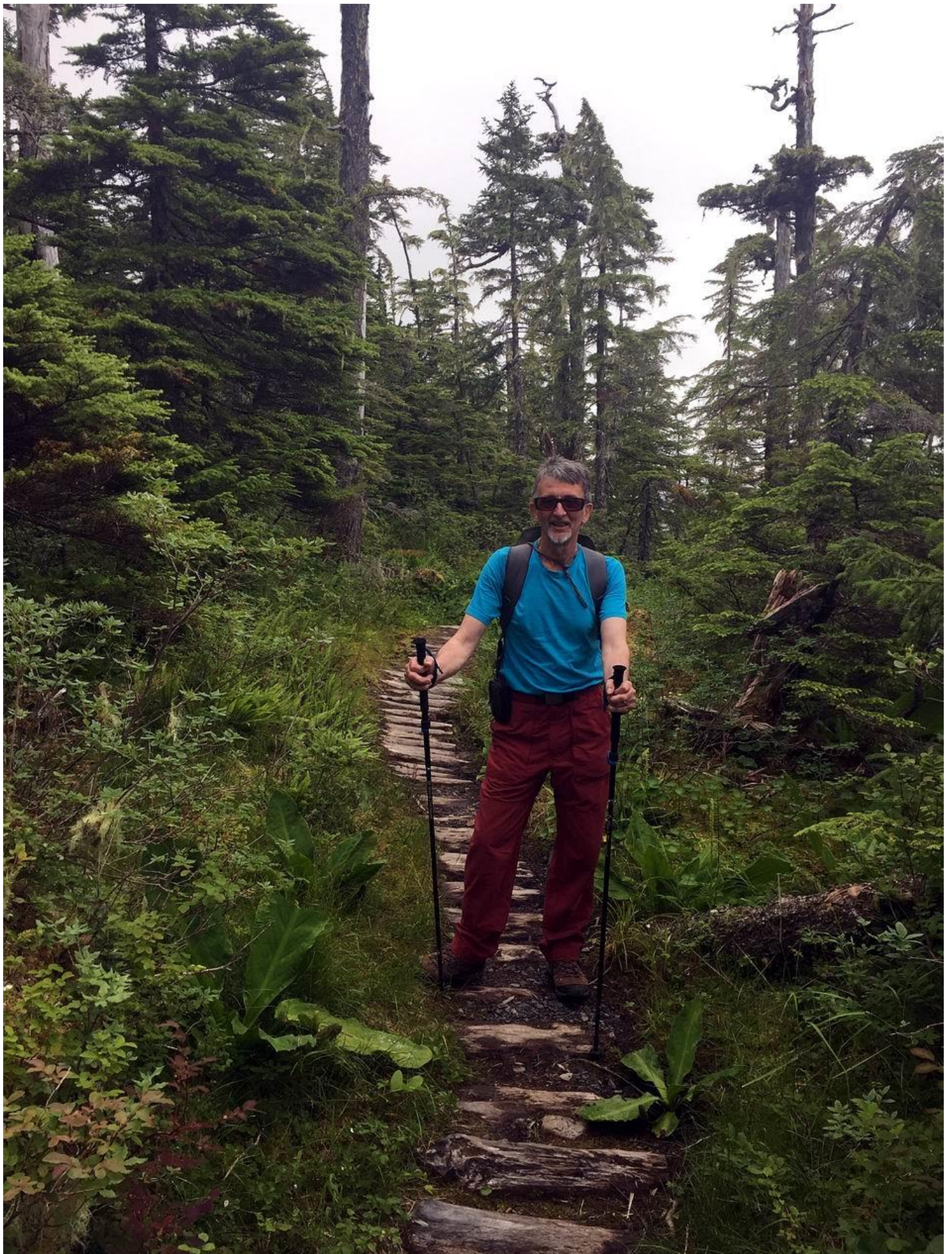
Later in the afternoon we took a hike up to Crater Lake taking two hours of hard walking to reach this high level lake and as we climbed we passed through a number of fascinating habitats, such as rain forest before we reached the alpine zone around the lake.