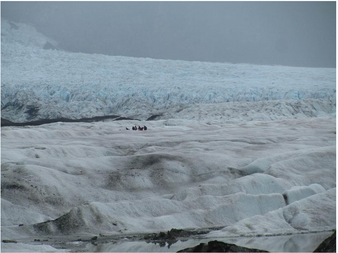
Sheridan glacier, Cordova Alaska