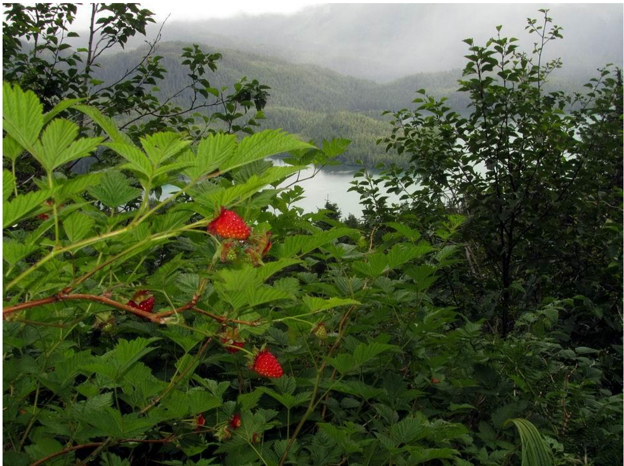
All the way up we snacked on a variety of delicious berries including Salmonberries ( Rubus spectabilis ).