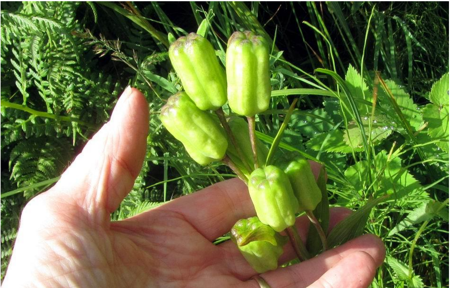
Fritillaria camschatensis seed pods

While the most spectacular sight in this water meadow was currently the Spiranthes the large seed heads of Fritillaria camschatensis suggest it was equally beautiful when they were in bloom.