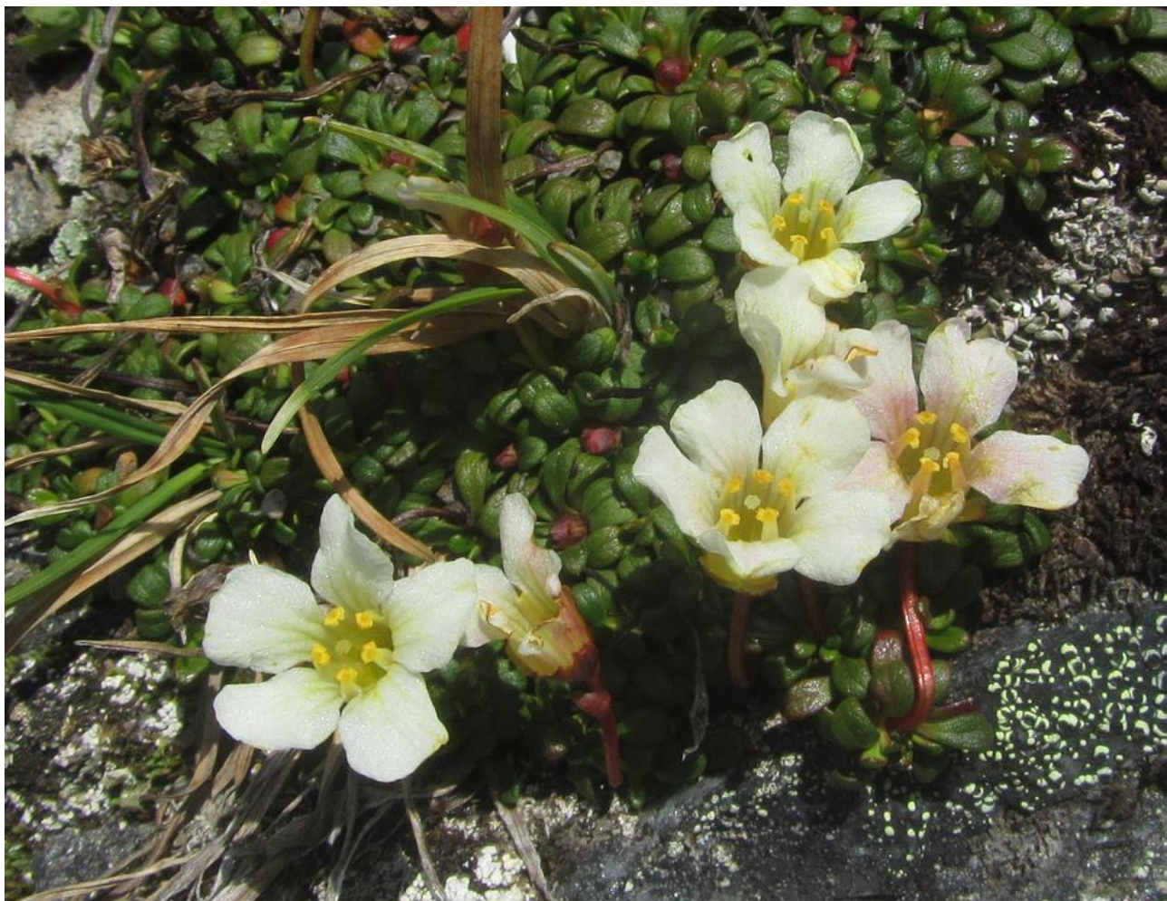
Another of my favourite species to see in the wild is Diapensia lapponica seen here growing at Hatcher pass.