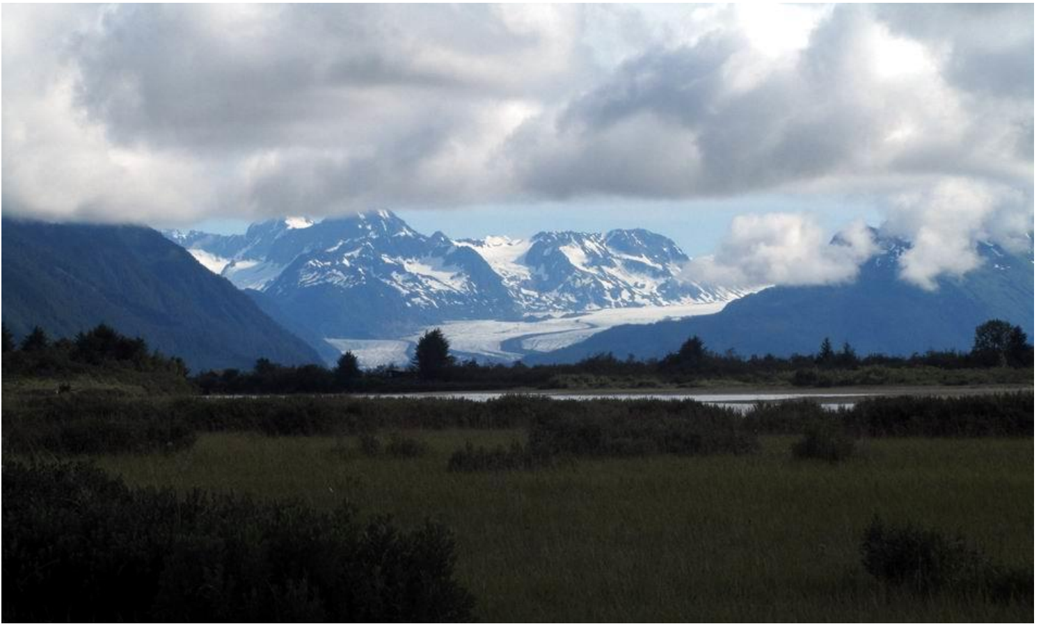
The view from the water meadow back towards the Sheridan glacier.