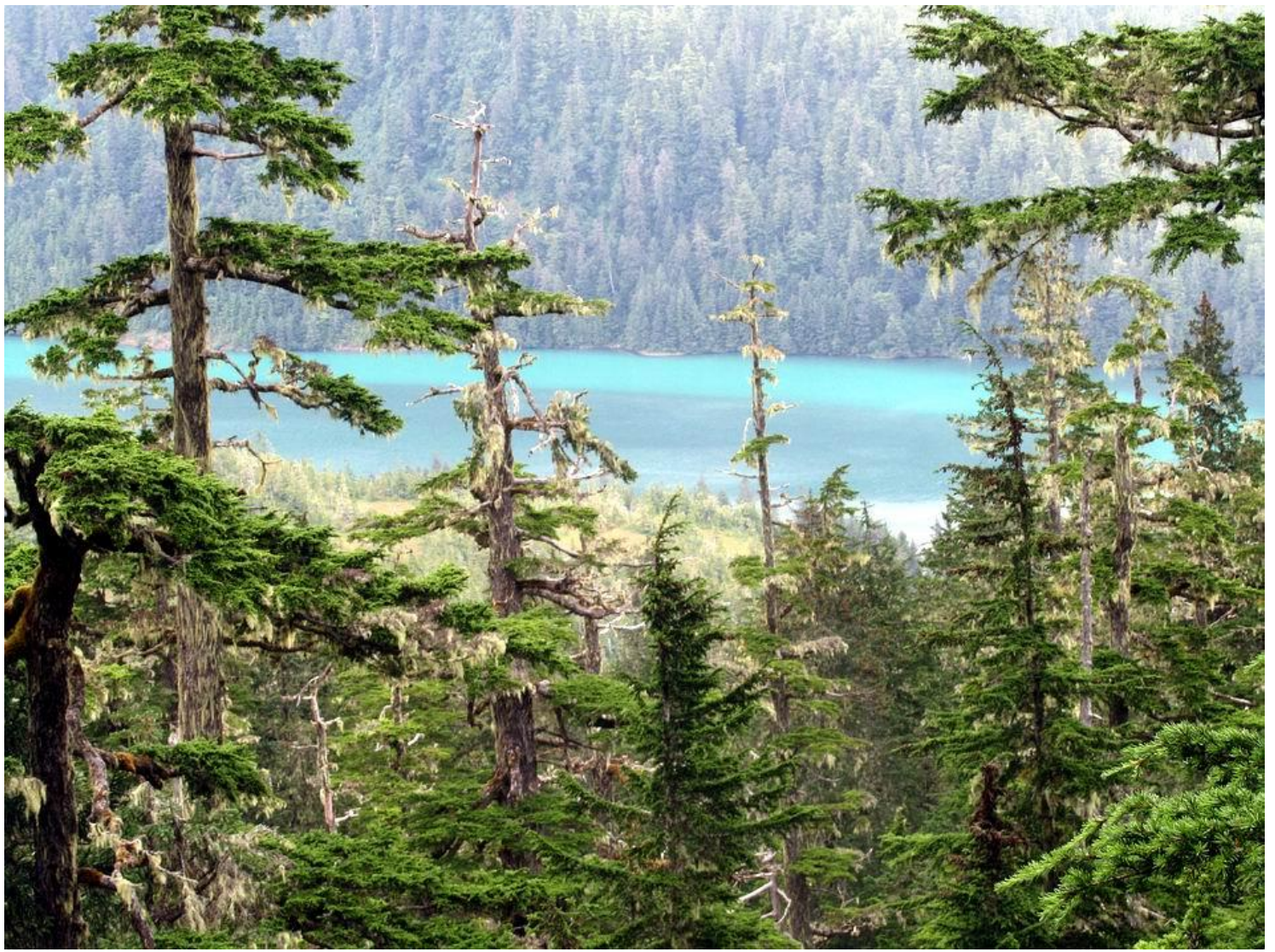
The rivers and lakes are all fed with water from the glaciers giving them the most wonderful colours.