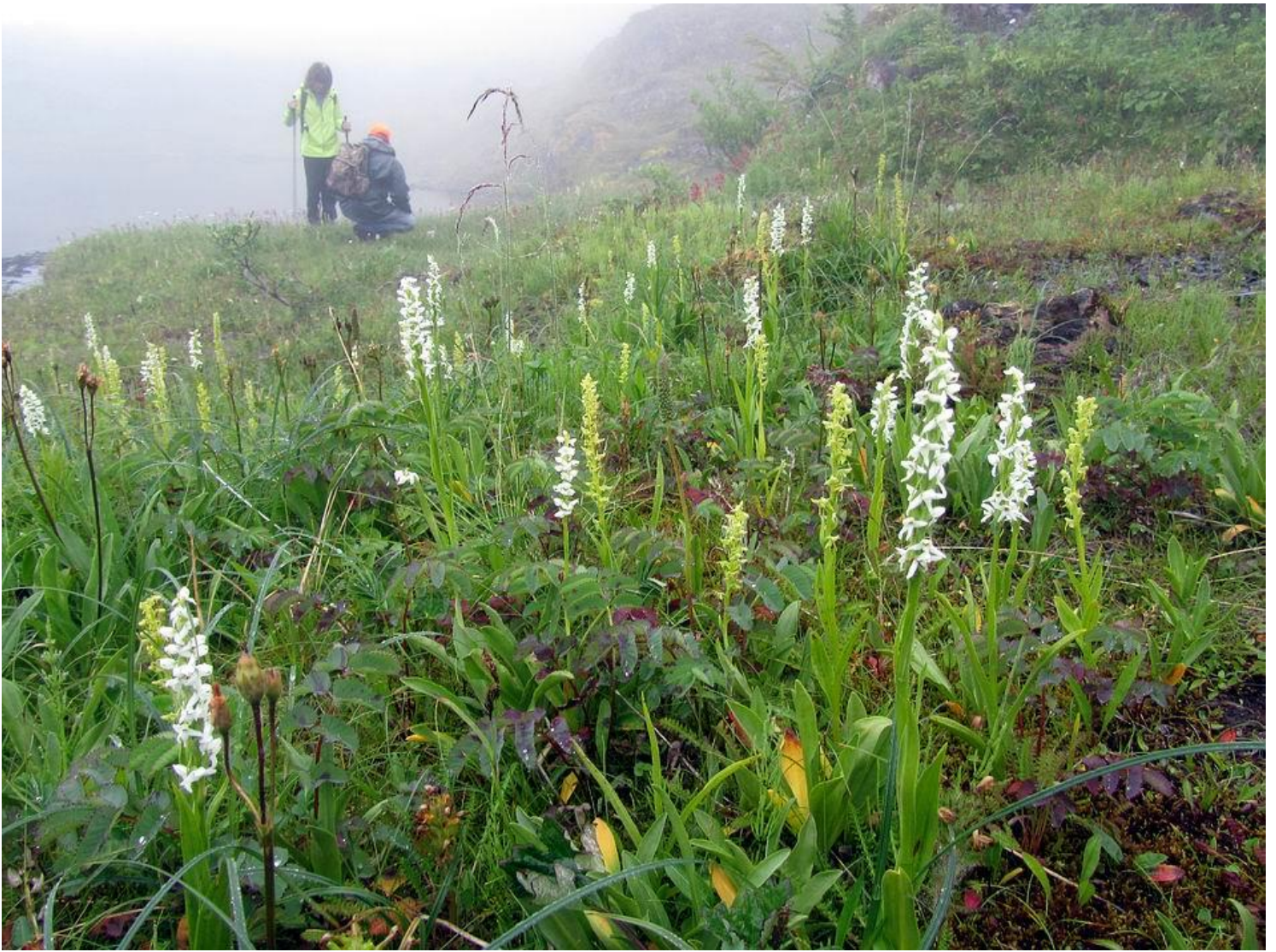
Yellow and white species of Spiranthes were thriving in the wet conditions.