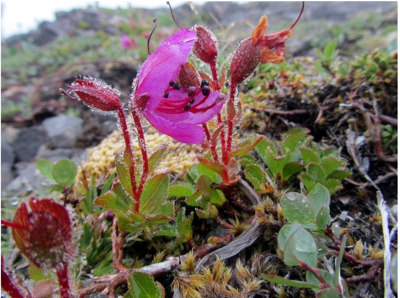
No doubting the name of Rhododendron camschatensis which again was mostly past flowering with just a few late flowers still in bloom. Below a Dodecatheon and a Saxifraga showing the fascinating habitat.