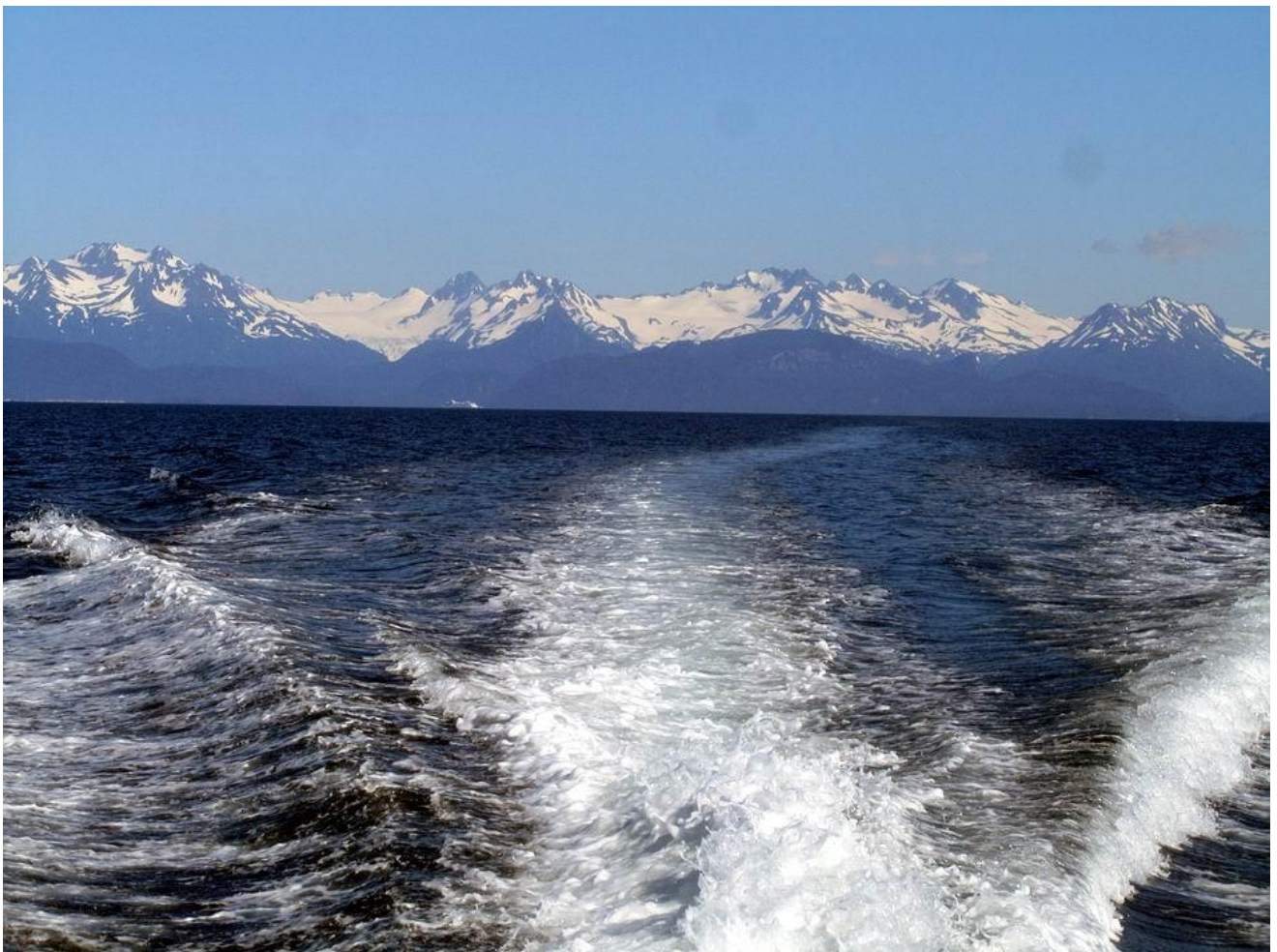
My last two nights in Alaska were spent in Homer where I enjoyed the most spectacular boat and fishing trip.